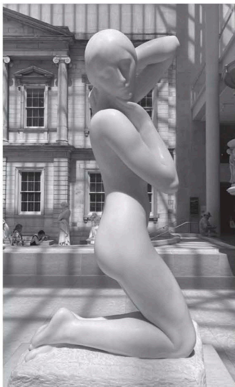
Top: The Seal , with Furio and Attilio Bottom: Fragilina , Metropolitan Museum of Art

Facing page: The Outcast , Woodlawn Cemetery, NY