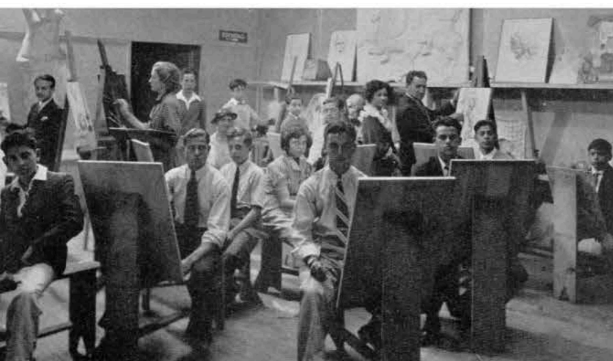
Top: Enrico Caruso Middle: Exterior the Leonardo de Vinci Art School Bottom: In the classroom

that at the time were distinctly part of the Italian way of life. They would discuss the physics and the poetry of sculpture in the context of the work being created. And of course, sculptors would continue showing up to supervise the work and to give their final approval.”