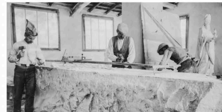
Top: Piccirilli studio